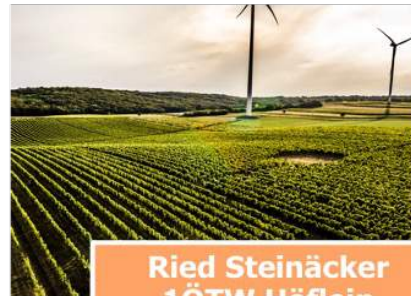
Ried Steinäcker 1ÖTW Höflein