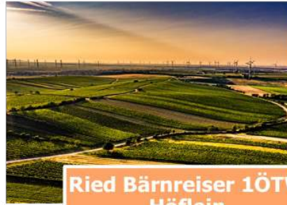
Ried Bärnreiser 1ÖTW Höflein