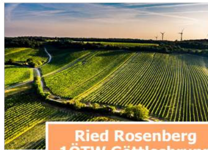
Ried Rosenberg 1ÖTW Göttlesbrunn