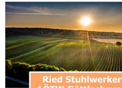
Ried Stuhlwerker 1ÖTW Göttlesbrunn