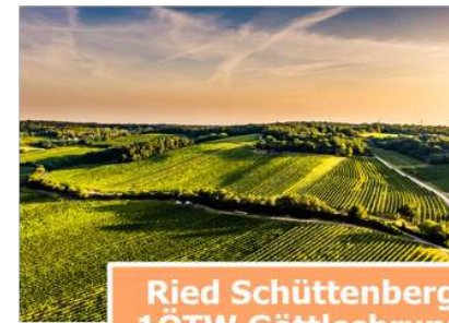
Ried Schüttenberg 1ÖTW Göttlesbrunn