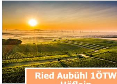
Ried Aubühl 1ÖTW Höflein