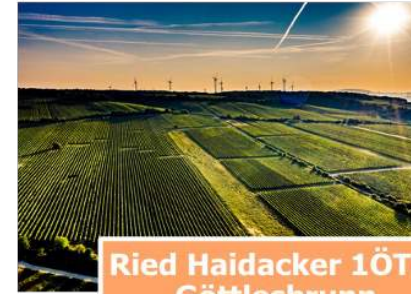
Ried Haidacker 1ÖTW Göttlesbrunn