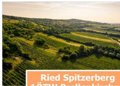
Ried Spitzerberg 1ÖTW Prellenkirchen