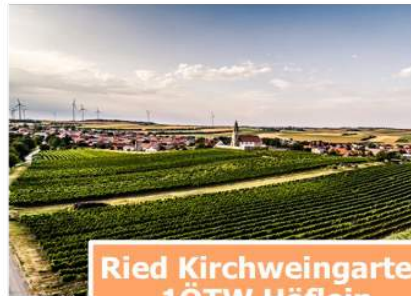
Ried Kirchweingarten 1ÖTW Höflein